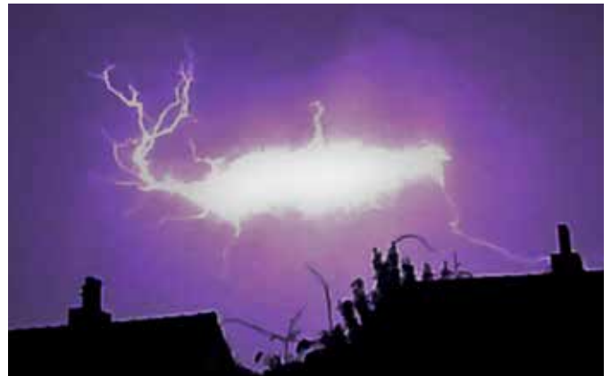
Ball lightning has been a mystery to scientists over the years.

during thunderstorms, some scientists theorize that it is caused by a lightning strike that vaporizes and electrifies minerals in the soil. Still, that is just one of many theories; as of yet, there is no definite answer as to what causes ball lightning.