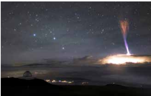
A red sprite and a blue jet were caught on camera in Hawaii in 2017. "Red sprite blue jet NOIRLab" captured by International Gemini Observatory/NOIRLab/NSF/AURA/A. Smith. CC BY 4.0/cropped.